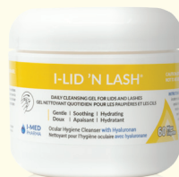
60 Pre-soaked Wipes